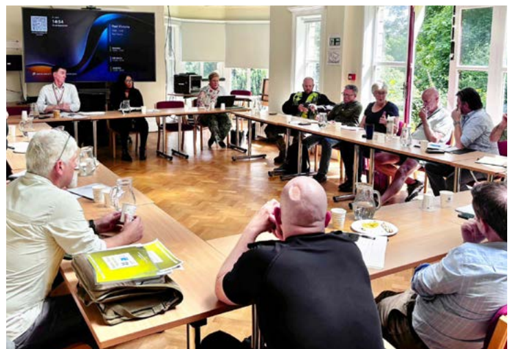
Peak District National Park Authority Meeting

In other partnership work, I am working alongside the force, businesses, residents and the Business Crime Reduction Partnership (BCRP) to strengthen the response to retail crime and maximise