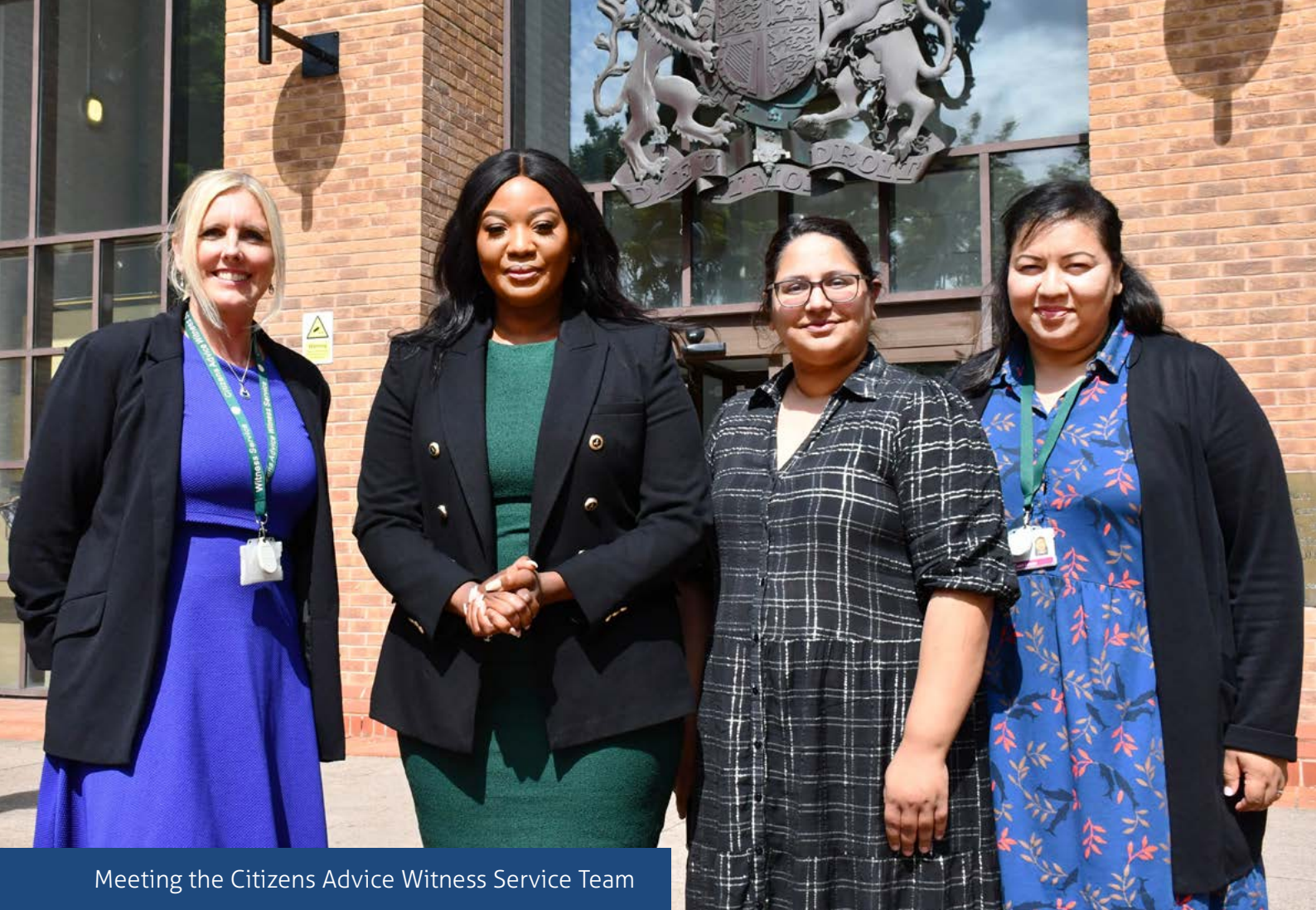
Meeting the Citizens Advice Witness Service Team